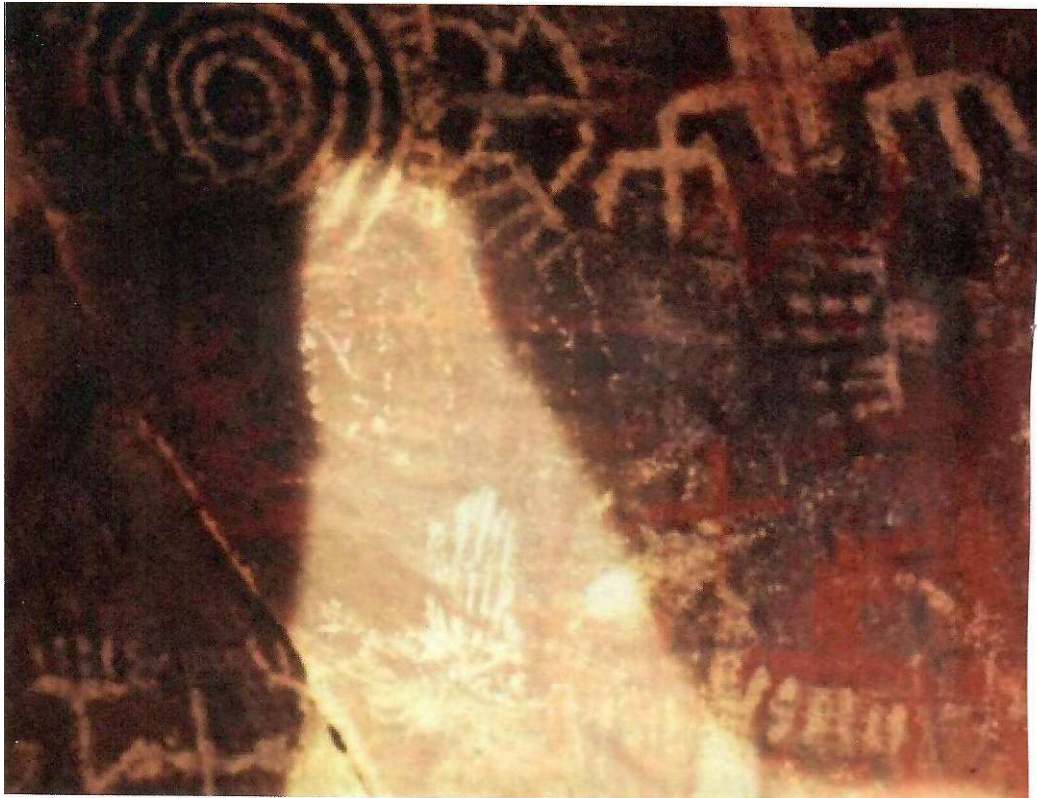
Figure 5. The "sun dagger" of light marking the Winter Solstice by pointing within the concentric circles pictograph