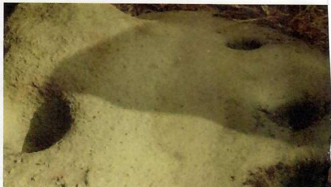
Figures 6 & 7. Summer Solstice monumental boulder showing the straight line of cupules; shadow cast from the monumental boulder which points to the largest mortar hole on the Summer Solstice.